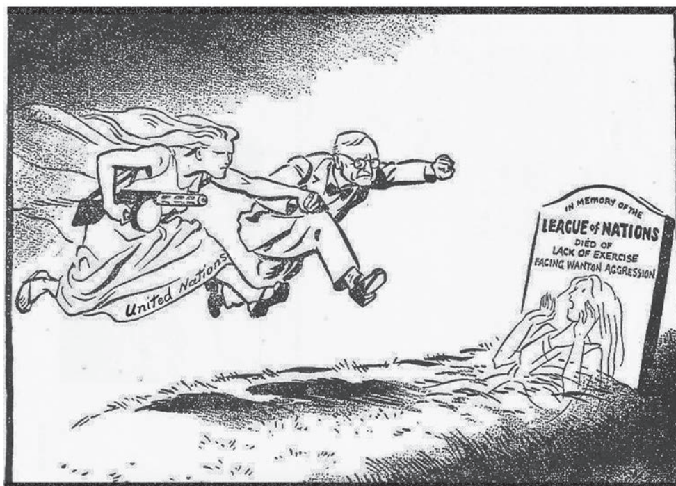
HISTORY DOESN'T REPEAT ITSELF

A cartoon published in Britain, 30 June 1950. The man holding the hand of the United Nations is President Truman.