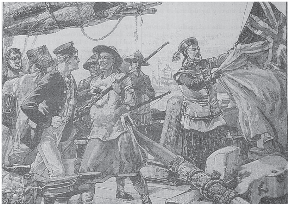
An illustration of events on the Arrow published in a British magazine in October 1856.